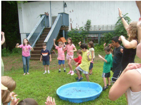
Awesome Mountain Summer Camp

Our mission is to proclaim the transfiguring love of God for all God's children through worship and service, welcome and caring, word and deed.