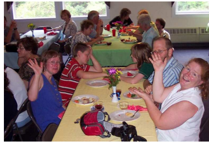
Sunday breakfast at Transfiguration